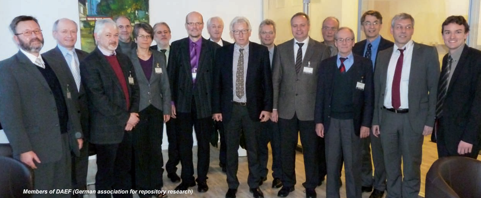
Members of DAEF (German association for repository research)