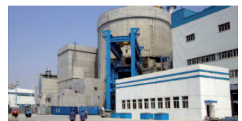
Qinshan, China's first reactor started operation in 1991

The consortium members are ANDRA (France), COVRA (The Netherlands), DBE TECHNOLOGY GmbH (Germany), ENRESA (Spain) and SKB International AB (Sweden). The Kick-off meeting took place in Beijing on November 26, 2014, and the project duration is three years.