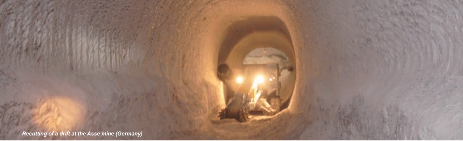
Recutting of a drift at the Asse mine (Germany)