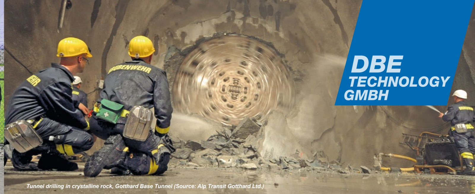
Tunnel drilling in crystalline rock, Gotthard Base Tunnel