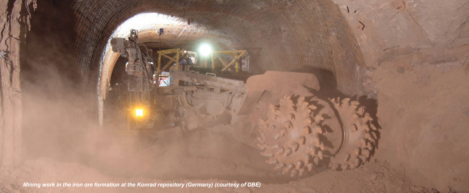
Mining work in the iron ore formation at the Konrad repository (Germany)