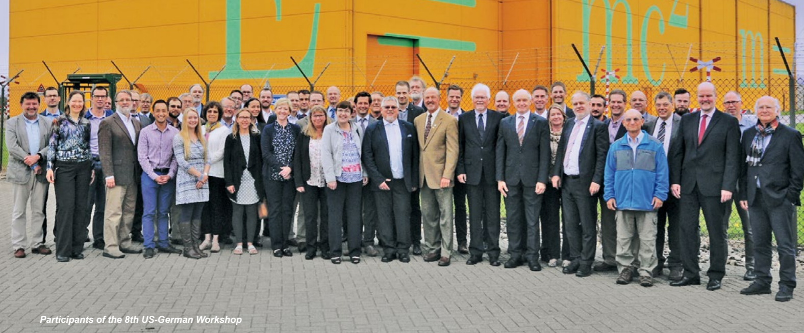
Participants of the 8th US-German Workshop