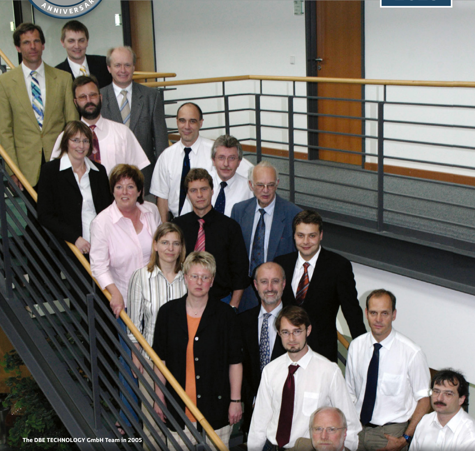
The DBE TECHNOLOGY GmbH Team in 2005