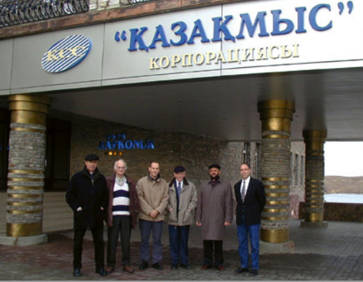
Site characterisation at Shezkazgan mine in Kazakhstan