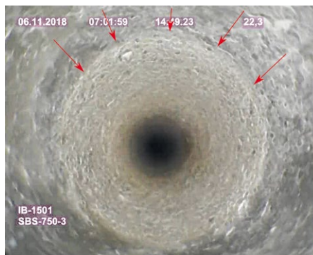
Borehole endoscopy – set MgO-concrete of a drift seal and surrounding rock salt (red arrows mark the interface)

mine. For a first sealing measure, the material was mixed above ground and transported in tanks to the job site on the 700-m-level. This procedure, which required an extremely long pot life, was a first for high-quality magnesia binders. Finally, it was decided to use the mixture as reference material for the sealing of further boreholes that are planned for exploring the position of a new mine shaft at the Asse mine.