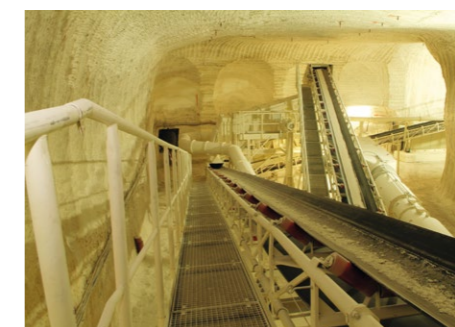
Salt crushing installation at the Asse salt mine

As the Asse mine has been operated for more than 100 years, a large number of boreholes have to be sealed in order to avoid that fluids bypass the drift seals. Because borehole diameters are much smaller than drift diameters, concretes with coarse salt aggregates cannot be applied for borehole sealing measures. Thus, a fine-grained and highly flowable MgO-mortar – called IM-Asse-1 – was developed, which is based on the same components as the magnesium oxychloride concrete in order to ensure compatibility of the building materials. To optimise the material properties, experts of BGE TECHNOLOGY GmbH modified the proportions of the mortar components. Moreover, the different production and processing conditions of concrete and mortar were taken into account. In the case of borehole sealing, it has to be considered that the borehole itself induces friction on the mortar suspension. The shear stresses