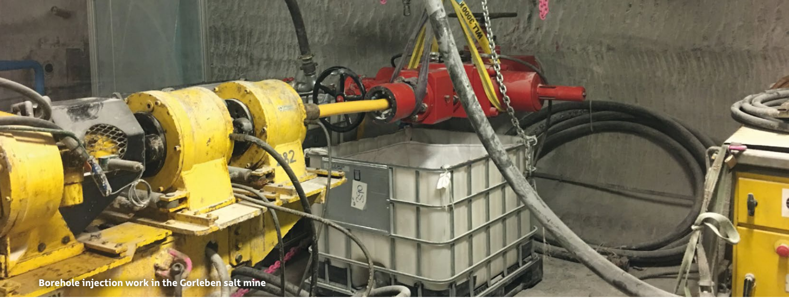
Borehole injection work in the Gorleben salt mine

For reasons of long-term stability, it was decided to use magnesia binder as sealing material, and for reasons of efficiency, a tried and tested recipe was adapted to the needs. Nevertheless, this recipe could not be used to fill the largest and longest boreholes. Consequently, a new recipe had to be developed and tested. Experts of BGE TECHNOLOGY GmbH prolonged the workability time (pot life) of this material significantly by changing the type of magnesium oxide binder and by optimising its calcination process in consultation with the producer. The second part of the work focused on adapting the material properties by adjusting the proportions of the components. Innovative was the use of cooled magnesia binder in order to lengthen the pot life and to avoid thermal stresses, which could lead to cracking during hardening.