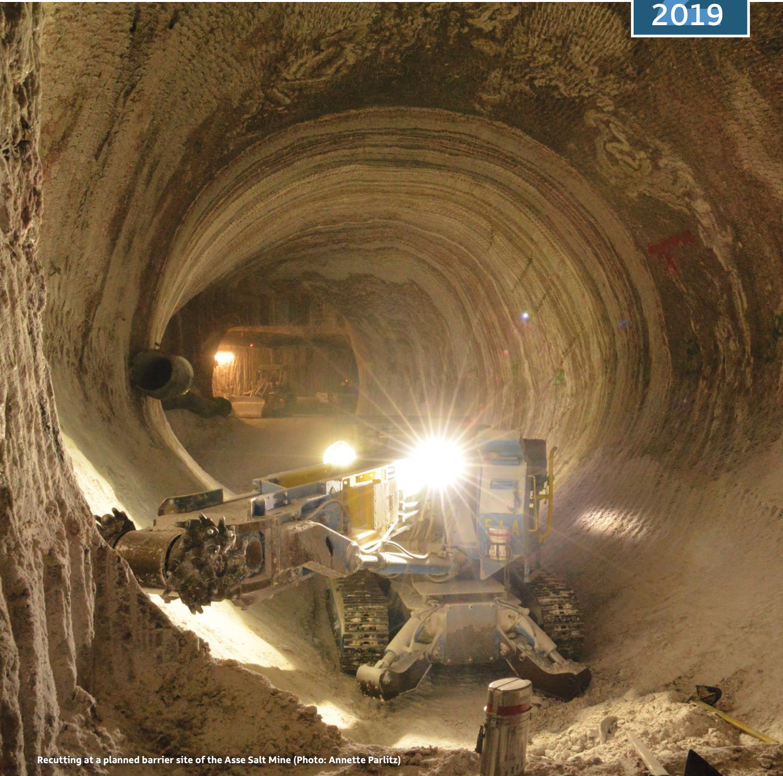
Recutting at a planned barrier site of the Asse Salt Mine