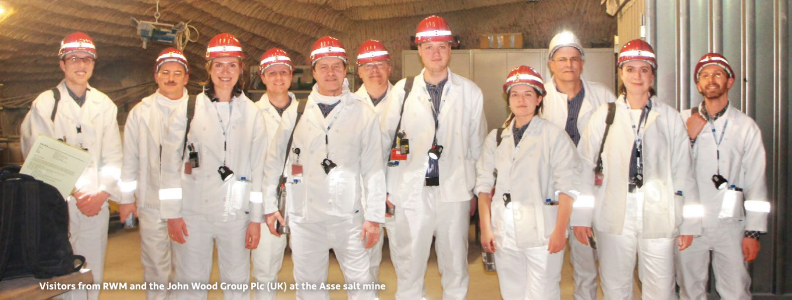
Visitors from RWM and the John Wood Group Plc (UK) at the Asse salt mine