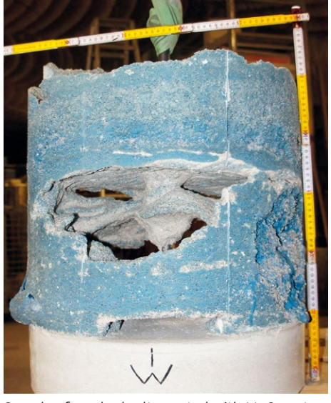
Sample of crushed salt grouted with MgO-water glass mixture (marked in blue)

which are potential pathways for fluids. As a result, the range of use of these grouts is limited, and water glass is used to seal finer flow paths. However, experience has shown that the penetration of particles can be improved if water glass is injected first and the grouts are injected immediately afterwards. This effect can be explained by a lubrication of solid surfaces and the effect that water glass dissolves salts before gelation and hardening can start. This finding suggests combining water glass, as carrier fluid, with reactive additives. The development work led to novel grout families that also have many other benefits. At elevated injection pressures, the water glass and non-inert solutions are squeezed out of the mixtures, which themselves act as an independent injection agent. This way, it is possible to fill or seal fractures and pore systems of very different sizes in one injection step for the very first time.