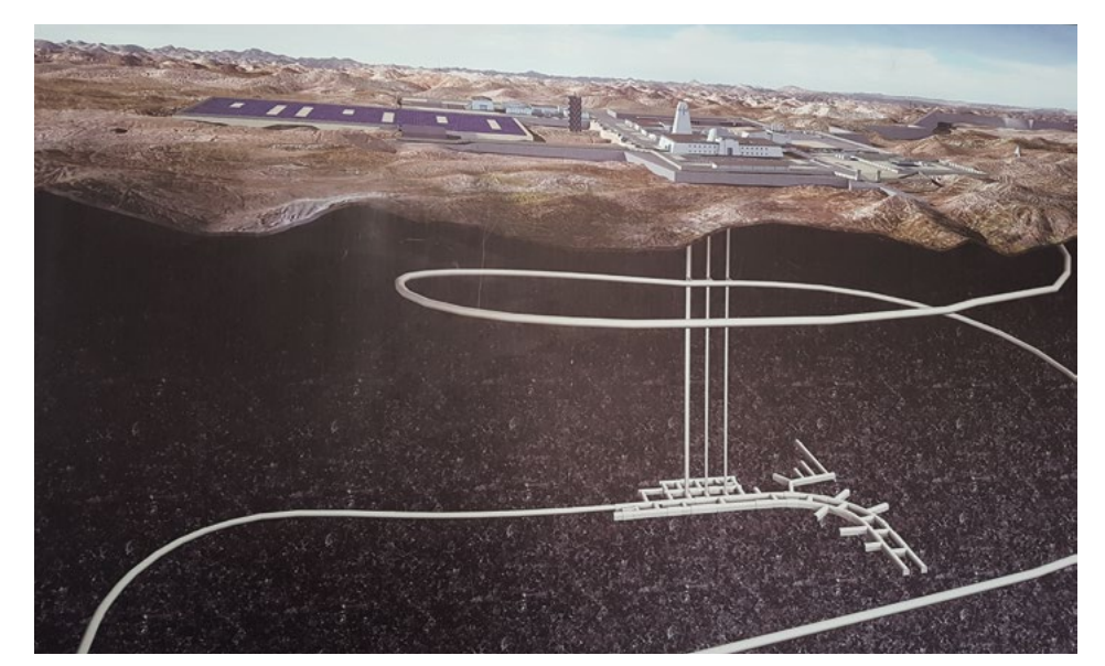
3D model of the planned Chinese URL in Xinchang

As part of their ongoing support to Iraq in regard to radiological safety, the European Commission launched an INSC project (Instrument for Nuclear Safety Cooperation) for the development of the technical design of a national Low-Level Waste (LLW) disposal facility in Iraq and the preparation of the associated safety assessment report. In 2015, this project was granted to a consortium of NUKEM Technologies GmbH as leader, BGE TECHNOLOGY GmbH, and the Slovak radioactive waste management organisation JAVYS a.s. The specific tasks that were primarily carried out by BGE TECHNOLOGY GmbH were the selection of the best suited disposal concept, the conceptual design of the disposal facility, its technical design, and the preparation of a Pre-Construction Safety Assessment Report. The latter two documents, which are supposed to build up the main part of the documentation needed for the application of a construction license, were finalised in spring 2019.